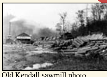
Old Kendall sawmill photo.