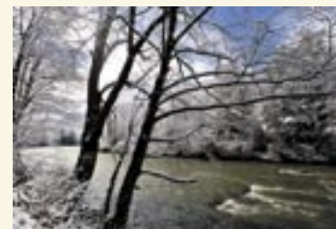
Kendall Trail in winter..