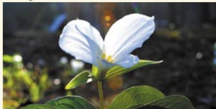
Trillium is one of the many wildflowers found along the trail.

increasingly difficult. The railroad grade is easy to follow for another 2.5 miles until it dead ends at The Dillenger Hole (local name) - National Falls, (boater name). Hikers should be prepared and have adequate water, snacks, gear and clothing. Caution and care should be exercised and the