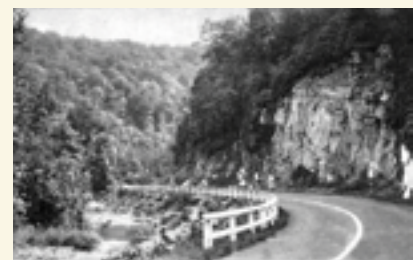
Approach to Horseshoe curve 1930's

There are several places to pull off the road and nice spots to relax alongside the creek. Turn right at 219 to return to the Deep Creek Lake area.